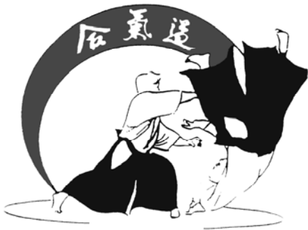
USA Aikido Association