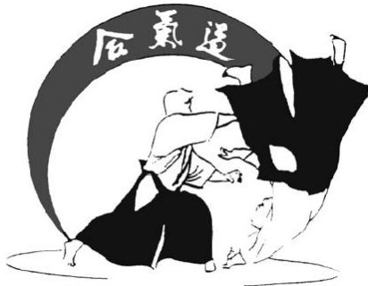
USA Aikido Association